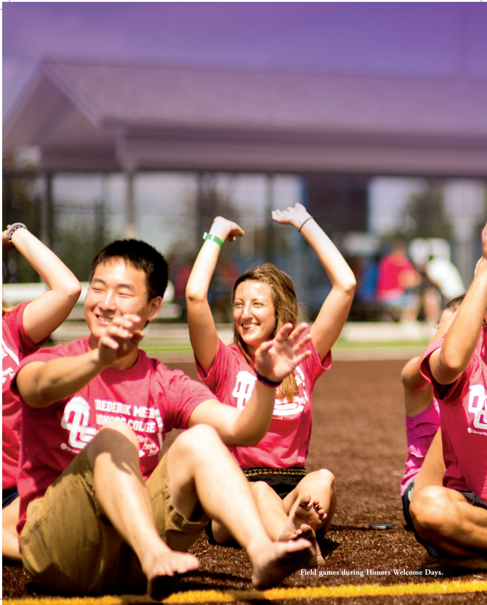
Field games during Honors Welcome Days.