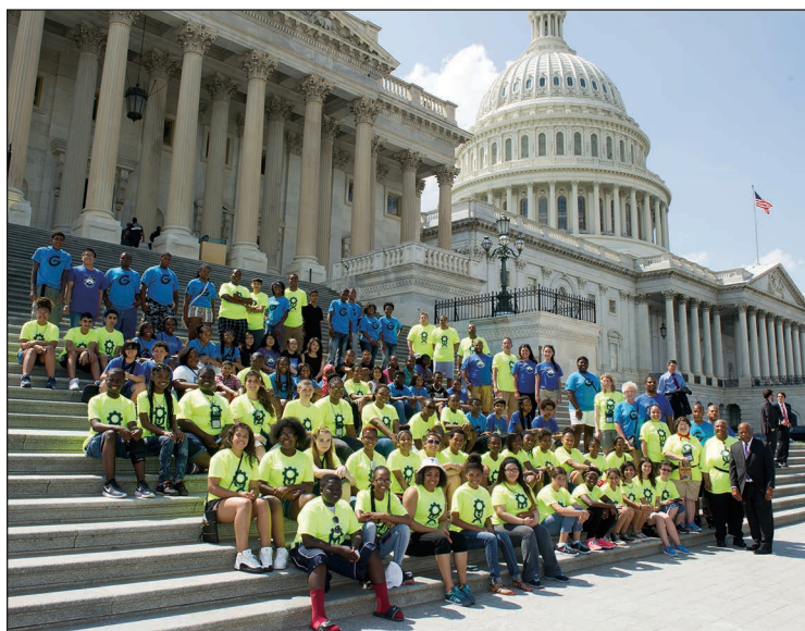
Congressman Lewis and Michigan State University, Grand Valley State University and University of Michigan–Flint