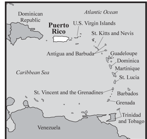
Boundary representations are not necessarily authoritative.