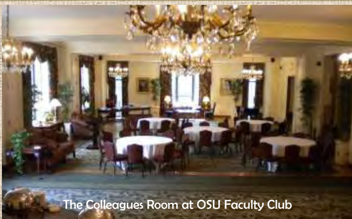
The Colleagues Room at OSU Faculty Club

Join UClub friends for a pre-performance social at the One Trick Pony Grill and Taproom, 136 E Fulton in downtown Grand Rapids, 6:00 pm.