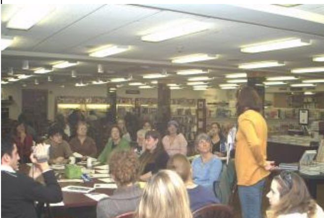
Department of Peace informational meeting.